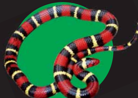
Scarlet King Snake