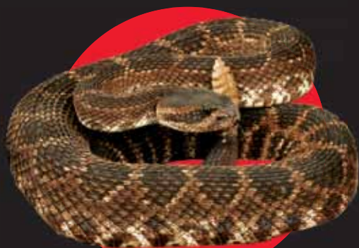
Eastern Diamondback Rattlesnake